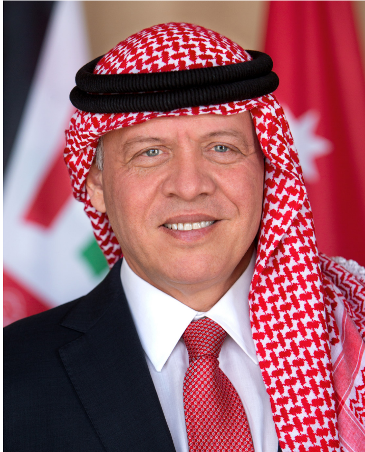
HIS MAJESTY KING ABDULLAH II IBN AL-HUSSEIN