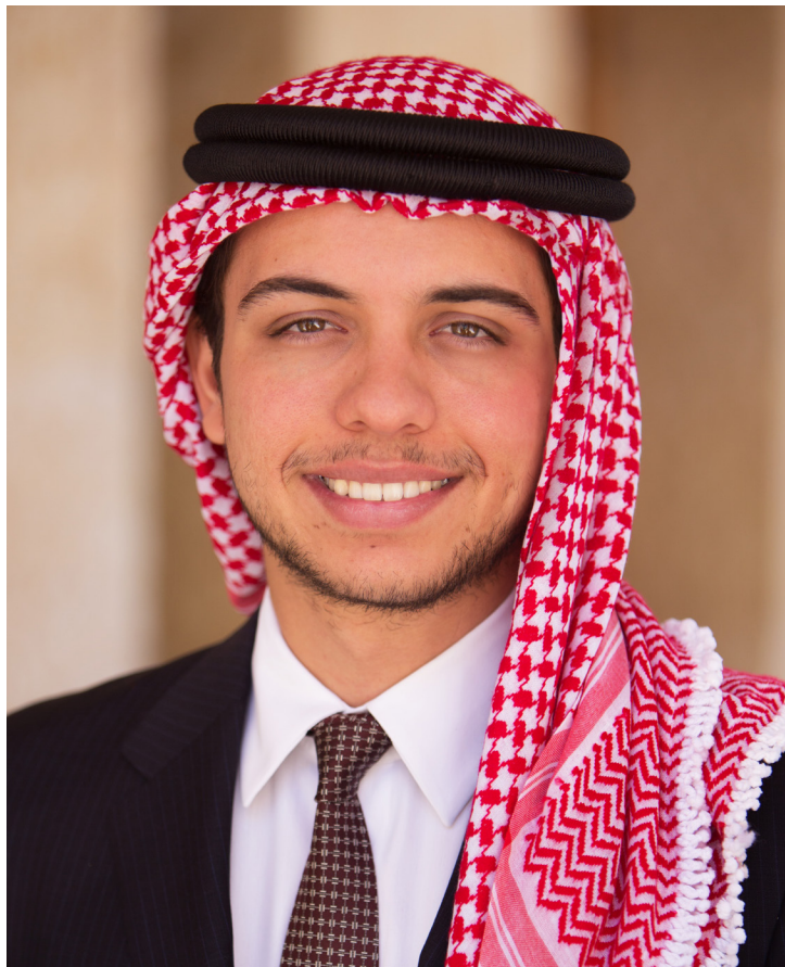
HIS ROYAL HIGHNESS CROWN PRINCE AL-HUSSEIN BIN ABDULLAH II